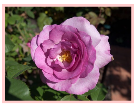
Heritage-Ben Matus, October 2010