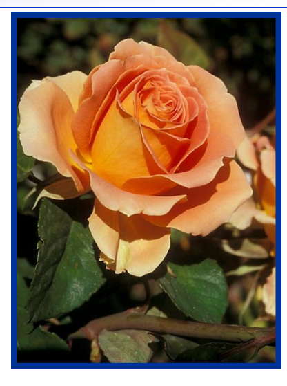
Brass Band