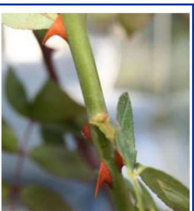
Bud eyes can be found all along the canes at the leaf axils, (where a leaf cluster was or is connected to the cane).

tly brushing the bud union with the small wire brush to remove the hard corky bark that has formed over the last year. Avoid brushoff ing any basal breaks that may be emerging. basal break is a strong new