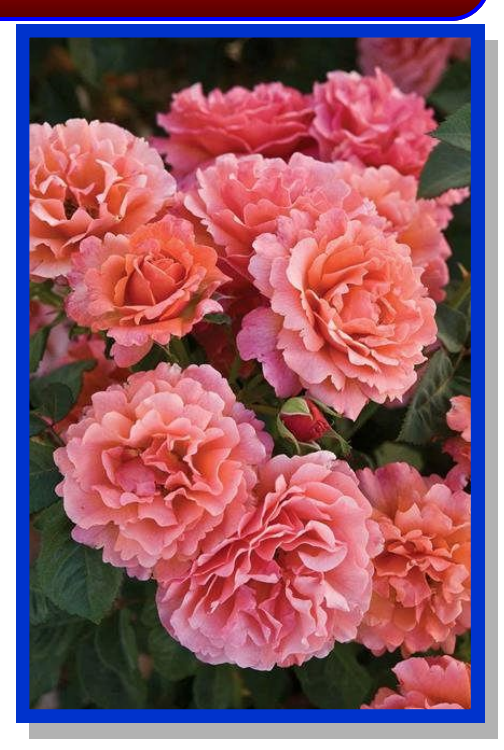
'Easy Does It'

In addition to the ARS 2013 Mem-'Easy Does It' is classified as a floriber's Choice Award, 'Easy Does It" has won many past awards in various rose trials throughout the world and in 2010 was selected as the AARS (All American Rose Selection) winner. You can find more information on 'Easy Does It' at "Help Me Find" Roses: (http://www.helpmefind.com/garden