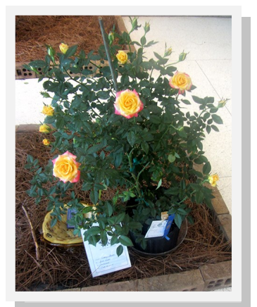
'Bees Knees' Small Rose Container Grown—Larry Baird