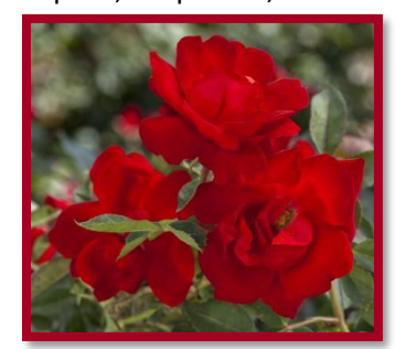
Brick House' Floribunda Bred by Meilland Introduced by Star Roses

Six roses took home honors as the 2021 AGRS winners. 'Brick House', 'Brindabella Purple Prince', 'Easy to Please', 'Sweet Spirit', 'Top Gun', and 'Tropica'. Of these six winners, all but 'Top Gun' were winners in the (continued p. 3)