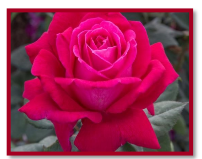
'Sweet Spirit' Bred by Meilland Introduced by Star Roses

South Central Region which includes Arkansas: Winners in the Southeast Region which includes Kentucky and Tennessee were: 'Easy to Please', 'Sweet Spirit', and 'Top Gun'. 'Sweet Spirit' was a winner in all regions and also the Fragrance Award Winner.