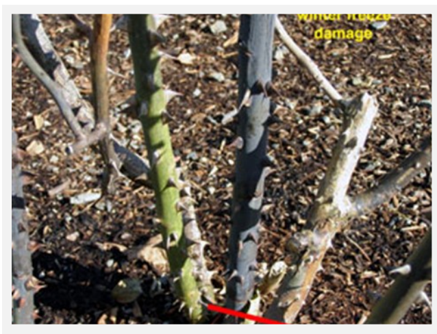
Example of winter freeze damage.