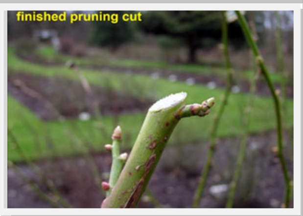
(continued on page 4)