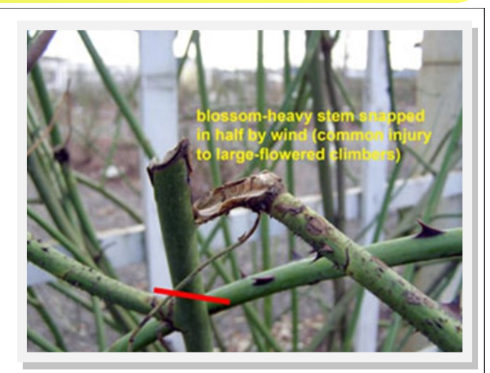
Blossom-heavy stem snapped in half by wind (a common injury to large-flowered climbers).