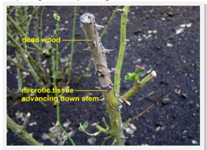
Examples of dead rose wood and necrotic tissue advancing down the rose stem.

Damaged or diseased wood is also easy to spot, and often goes hand in hand as damaged areas create entry opportunities for diseases. In roses, damaged areas are common on crossing branches, where motion from wind causes thorns to rub against adjacent canes. Wind damage can also occur during the main growing season when top-heavy branches laden with blooms snap in half during stormy weather. Diseased branches usually involve some type of stem canker or lesions from fungal diseases like black spot or downy mildew, and should be removed promptly to prevent the pathogen from spreading.