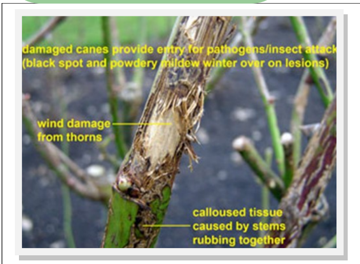
Damaged canes provide entry for pathogens and insect attack (black spot and powdery mildew winter over on lesions).