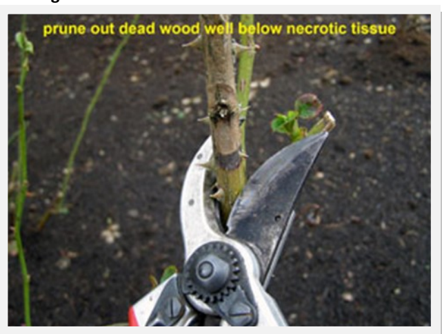
Prune out dead wood well below necrotic tissue.