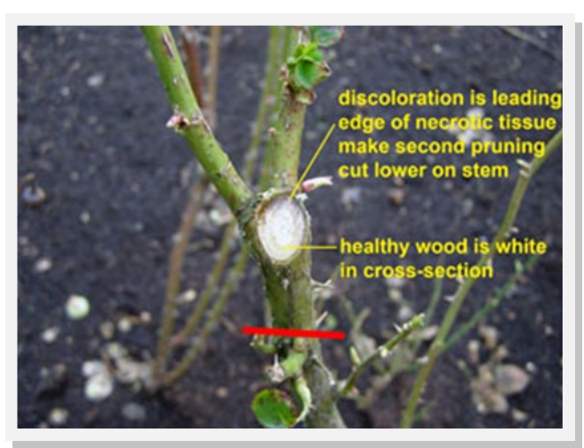
Discoloration is leading edge of necrotic tissue. Make a second pruning cut lower on stem. Healthy wood is white in cross-section.