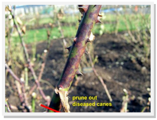
Prune out diseased canes. Again, the overall goal with rose pruning is to open up the center of the bush to allow for better air circulation and remove older wood. Maintaining a youthful, clean rose plant is the best way to keep your rose healthy and productive.