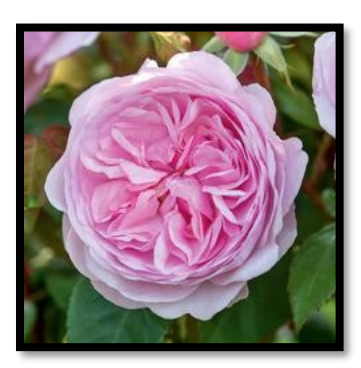
2020 Members Choice Award Members Choice Fragrance Award James Alexander Gamble Fragrance Award 'Olivia Rose Austin'