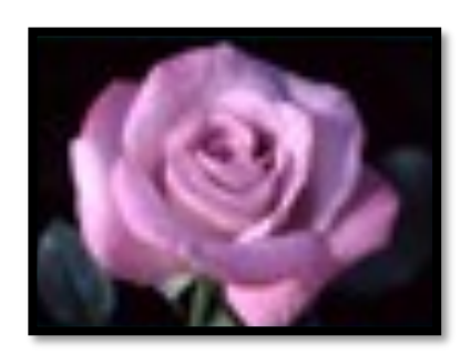
2020 M/MF Hall of Fame 'Scentsational' - Miniature Hybridizer: Kevin Saville