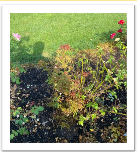
Rose Rosette Virus can be seen on these photos of bushes at the public rose garden taken by Dan Wernigk.

The request to install and maintain a rose garden at the Warren County Extension Office has been approved. We will need to discuss and vote on this at our meeting. If we are going to continue this project at the new location, then we will need the help of all members to create the beds this fall, plant roses next spring, and maintain it in the future.