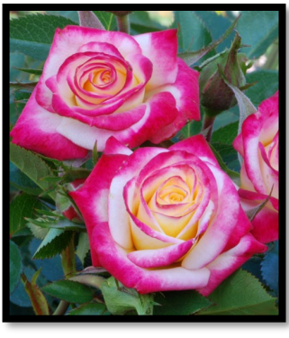
2020 M/MF Hall of Fame 'Dancing Flame' - Miniature Hybridizer: Robbie Tucker