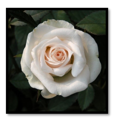
2020 M/MF Hall of Fame 'Linville' - Miniature Hybridizer: Dennis Bridges