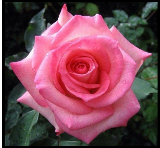
'Foolish Pleasure'