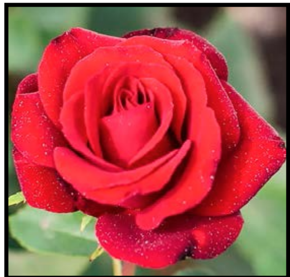
'Memphis King'

Dark red blooms are the signature of this miniature rose. The petals have a red reverse and an orange base. Whit Wells created this rose from two seedlings. Also high centered with exhibition form, the blooms grow one to a stem and in small clusters. The striking colors of the flowers make this rose an attention getter.