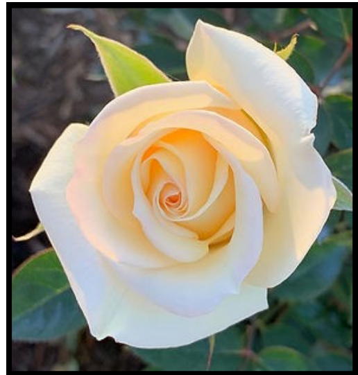
'Butter Cream'